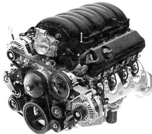
Figure 2: GMPT Gen V V8 Engine

*SAE J1349 Gross ratings without fan operating.